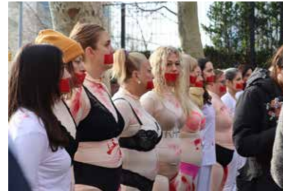
NYC, UN HQ