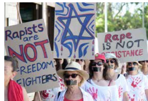
Bayron Bay Australia