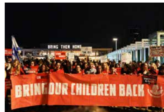
Tel Aviv Israel